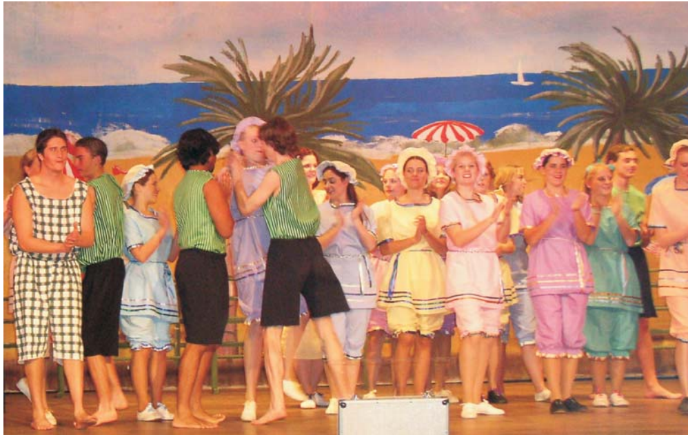
At the Riviera