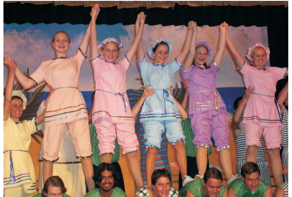
At the Riviera